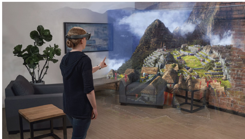
Figure 1 Microsoft HoloTours, a virtual field trip experience (see online version for colours)